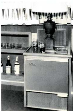
Optional bar and ice-maker replace four drawer end table.

Aft head and shower has lavatory, linen locker, water-proof wall and Vinyl deck. Large shower with hot and cold pressure water. Medicine cabinet with mirror, and two 110-volt outlets.