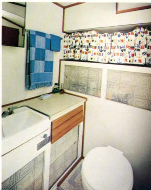
THE HEAD IS A BATHROOM. There is a vanity with lavatory, 12-volt light, 110-volt Duplex outlet for accessories. Electric toilet. Medicine cabinet with mirror. Full size stand-up shower. There is 9½ cu. ft. of storage space in vanity base, one drawer and an outboard locker. Screened portlight. Note the picture of the stand-up stall shower.