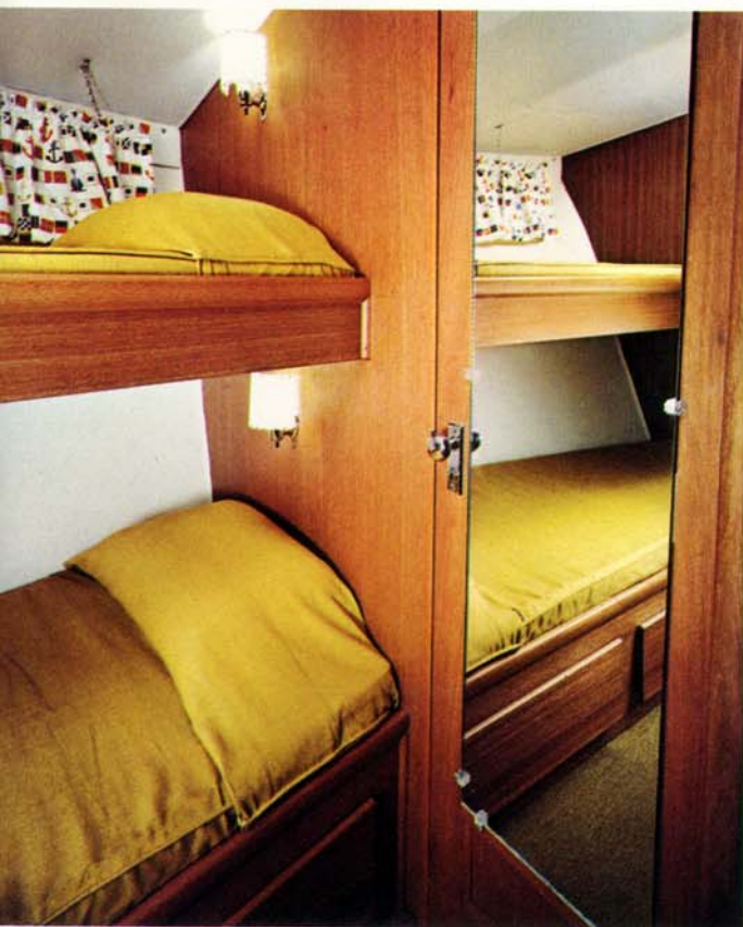
GUEST STATEROOM has upper and lower 6 ft. 3 in. bunks with foam mattresses. 12-volt lights over each bunk. Built-in chest, hanging locker and drawer beneath lower bunk provide 23 cu. ft. storage. Full length mirror on door of hanging locker. Floor is carpeted. Headroom is 6 ft. 3 in. Screened portlight.