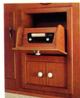
Stereo player is optional.

There is a 6 cu. ft. electric refrigerator under the counter. The counter space can be extended by lowering the section which covers the top of the stove when it is not in use.