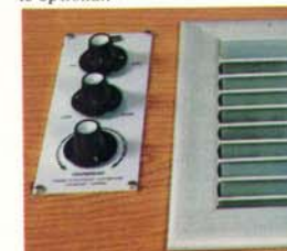
Air conditioning is optional.