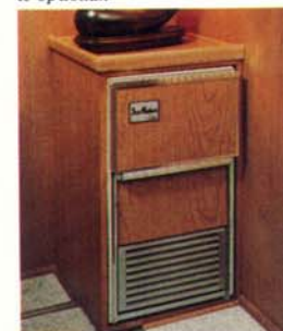
Ice maker is optional.