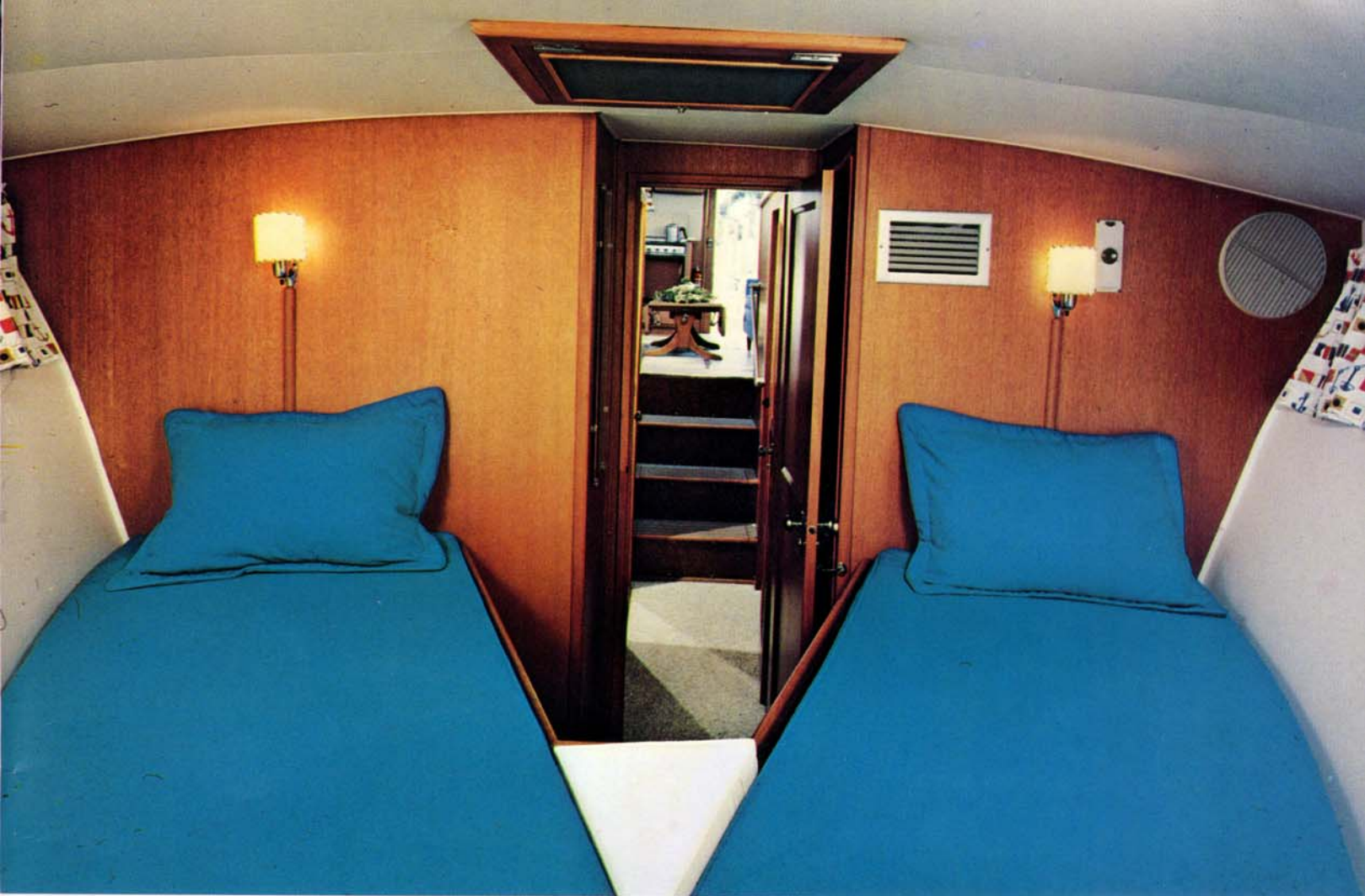
BOW STATEROOM has 2 Vee bunks each 6 ft. 3 in. with foam mattresses and a light over each bunk. Two screened portlights and an overhead screened hatch. Headroom is 6 ft. 3 in. Hanging locker and drawers beneath bunk and in V-cabinet provide 32 cu. ft. of storage space, plus additional space in rope locker. Vinyl floor and wall covering. Duplex 110-volt outlets, also a mirror.