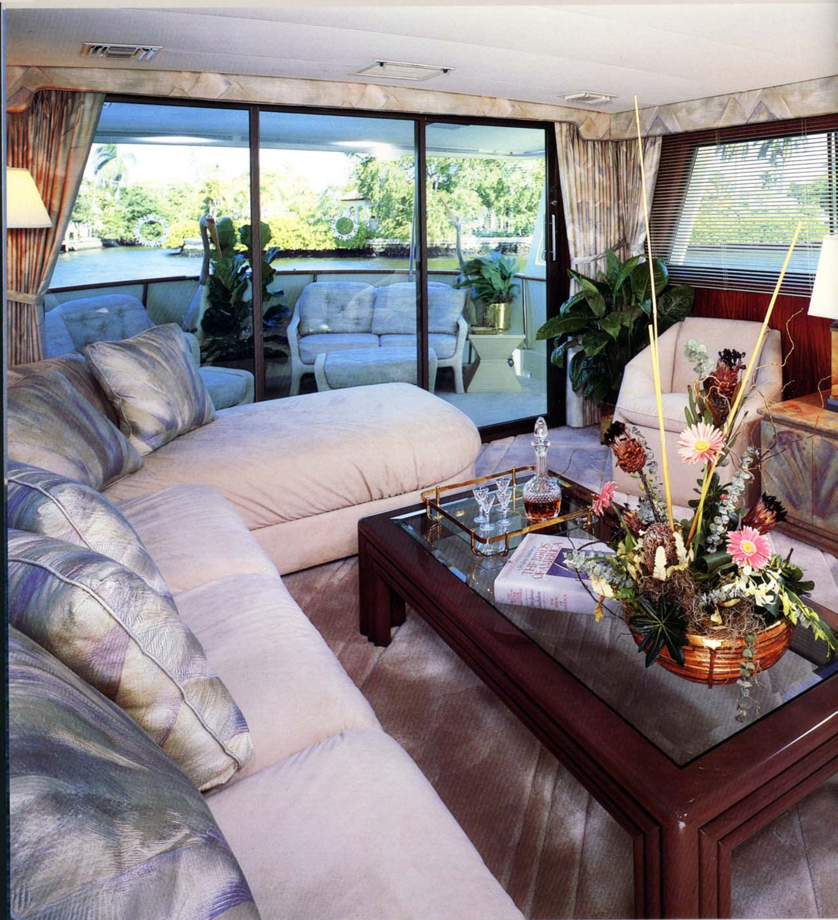
For a world class motor yacht, a world class Salon. It's fresh, light and very, very large. In this view looking through to the aft deck, you'll immediately notice the blend of the contemporary with the traditional Hatteras refinements.