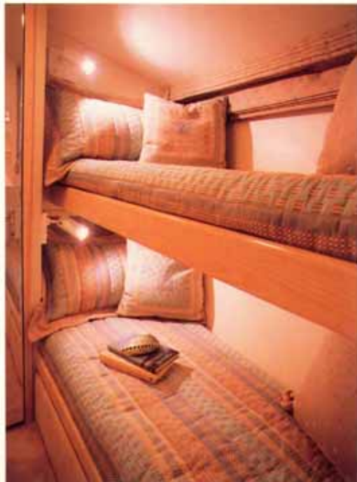
Portside Stateroom offers your crew upper and lower bunks that are honestly people-sized, with good, thick mattresses and other Hatteras-quality details like standard spreads and pillow shams.