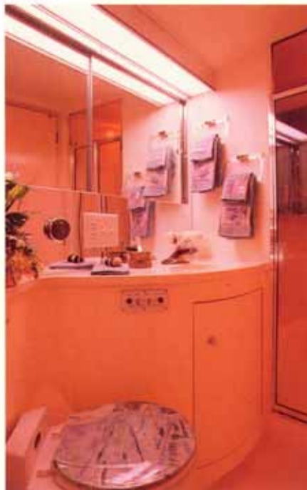
The Master Head. All the conveniences of home — your home at sea. Surprised to find a head like this in a 50? Remember, this is a Hatteras!