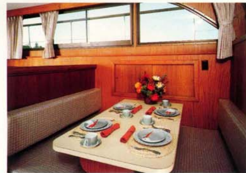
Practical convertible dinette seats four adults with ease, sleeps two with comfort.

As with the luxurious staterooms, these areas are paneled in rich wood—hand fitted and hand finished.