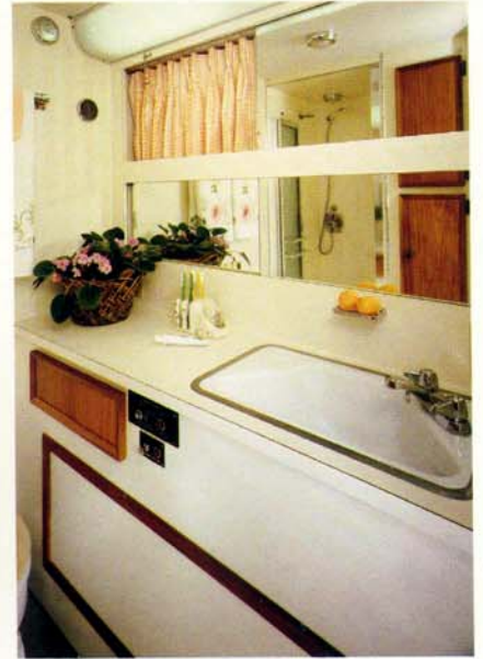
Master Stateroom's head with stall shower. Sundries storage at vanity and separate linen storage.

Master Stateroom with queen-sized bed (twin berths available as an option on boats ordered with standard engines), two full-length hanging lockers, two built-in nine-drawer chests and plenty of luxurious comfort.