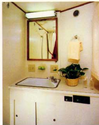
Guest head and shower with mirrored medicine chest and generous counter space.