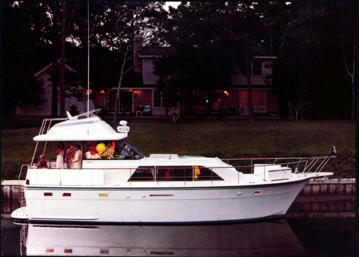
The Hatteras 43 Double Cabin.