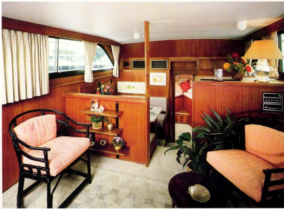
Forward portion of comfortable, airy Main Salon with convenient full dinette to port, galley to starboard. Companionway leads to Bow Stateroom.