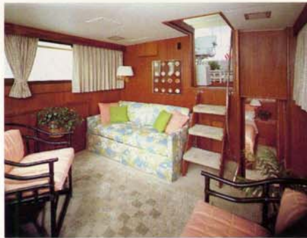
Aft portion of Main Salon. A great place to entertain or just plain relax. Also aft deck, companionway to Master Stateroom.