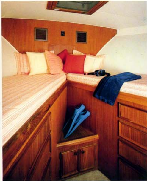
Guest Stateroom with Hatteras hallmarks: rich warm wood—hand-fitted and hand-finished; full-length hanging locker; excellent drawer space and wide, restful berths.

Master Stateroom with queen-sized bed (twin berths available as an option on boats ordered with standard engines), two full-length hanging lockers, two built-in nine-drawer chests and plenty of luxurious comfort.