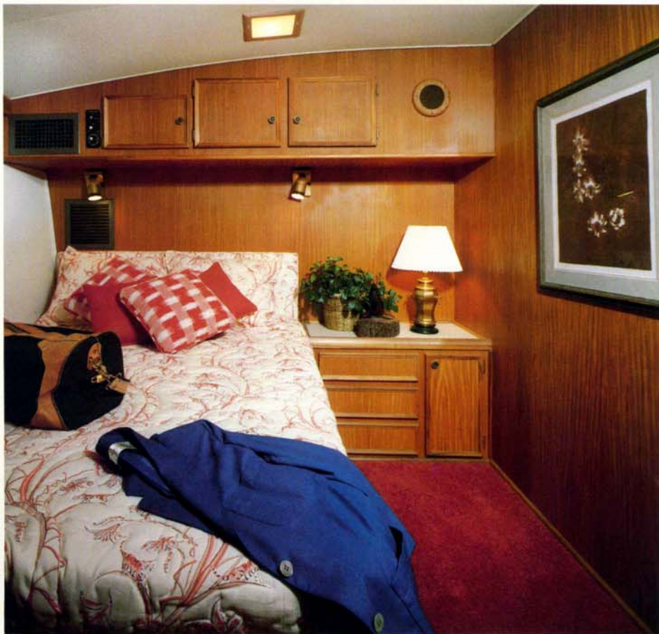
Master Stateroom with double bed option. Includes storage below bed, 4-drawer nightstand/dresser, hanging locker.

When you do, we believe your family and our Hatteras 43 Convertible will become inseparable.